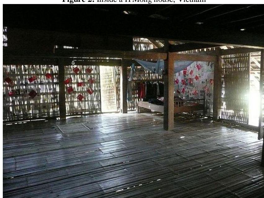
Figure 2: Inside a H'Mong house, Vietnam

When looking at the interior of a typical Vietnamese house, what one sees is a space that has no delimitations (rooms) functional to the individualistic concept of "privacy". What we see is rather one big space for the entire family. Movable partitions make it possible to dynamically adjust the space according to the needs of family life, which can become a bedroom, a shophouse or a place of worship. The perimeter of the house varies and measures the size of intimate and collective experiences in a flexible and quick way. The dwelling becomes a passage - house that communicates with the outside and extends organically towards the street, becoming a multifunctional living space.