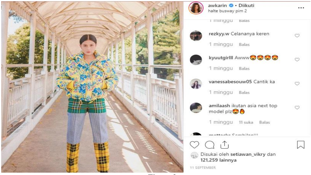
Figure 3 Fashion Awkarin