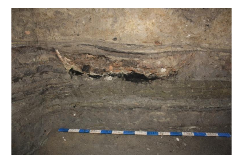
Figure 2. The furnace from which the charcoal sample was taken.

Fig. 2 illustrates the part of the archeological site where the charcoal sample was excavated.