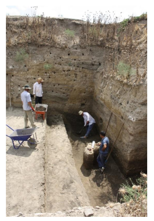
Figure 1 Polutepe archeological site

The cultural layer as a whole was relatively loose, clayey-ash, light grayish-yellow in color, with individual ash lenses and clay seals.