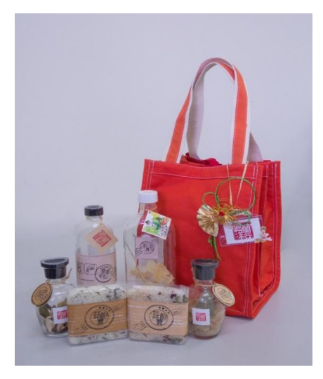
Figure 7: met bagpackaging design