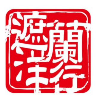
Figure 2: ZeelandiaFirmlogo

Figure 3 shows the brand concept diagram of ZeelandiaFirm. With the brand concept of ZeelandiaFirm as the core, from the outside to the inside are business philosophy, product elements, and brand objectives, for marketing the brand of ZeelandiaFirm.