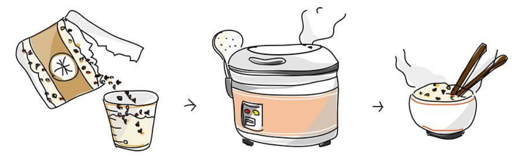
Figure 8: Rice seriesConcept

Based on the recipe of Sangria, ZeelandiaFirm added Golden Diamond Pineapple preserves (from Guanmiao Township of Tainan), sugar cubes produced by Taiwan Sugar, and local spices to produce a local flavor.