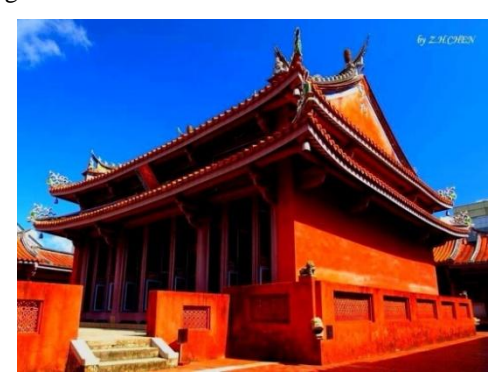
Figure 4: Tainan Confucius Temple

The use of Tainan orange color as the theme color of packaging also indicates the support for energy saving. Natural and eco-friendly materials are used to create the packaging. Based on the design concept of "multi-functional, environmentally-friendly, and traditional", the metbag designed by ZeelandiaFirm has a concise look and is appealing as a gift bag.