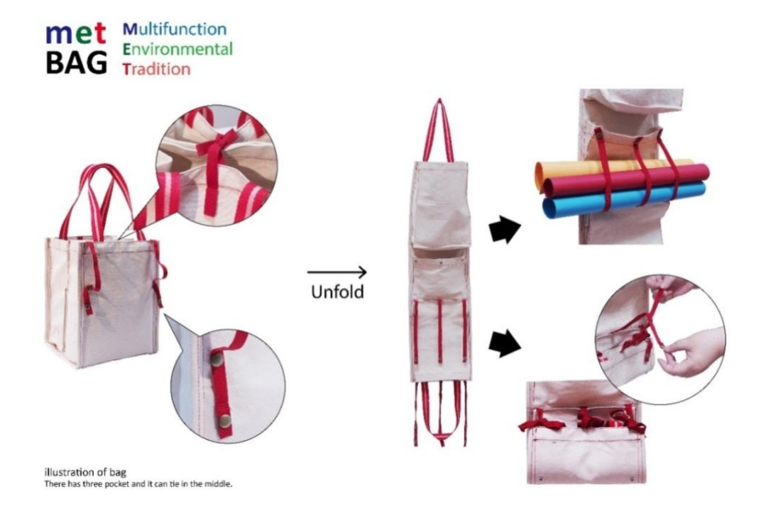
Figure 6: met bag design Concept

Multifunction+ Environmental+ Tradition= metbag