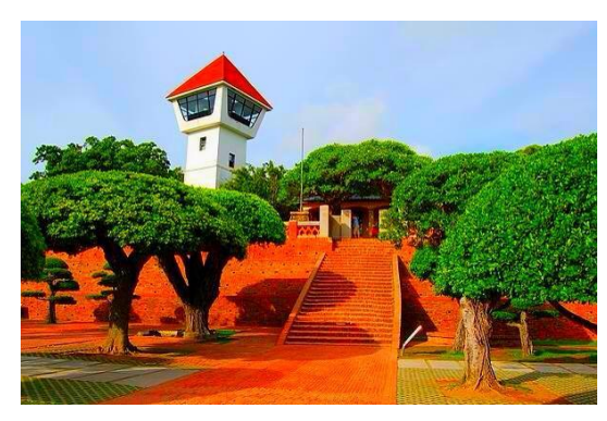
Figure 5 Anping Fort