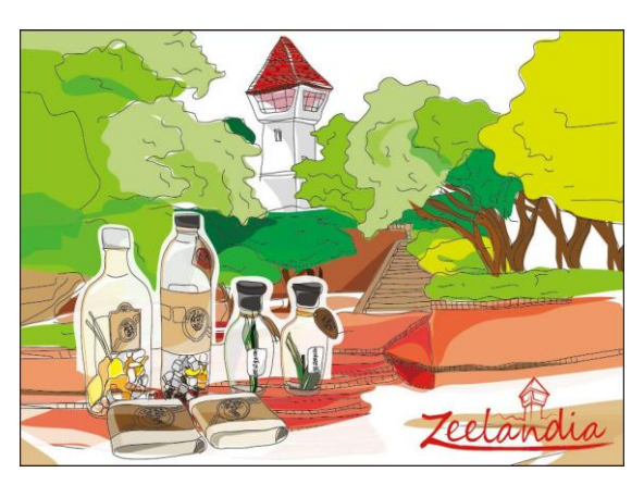
Figure 1: Brand Image