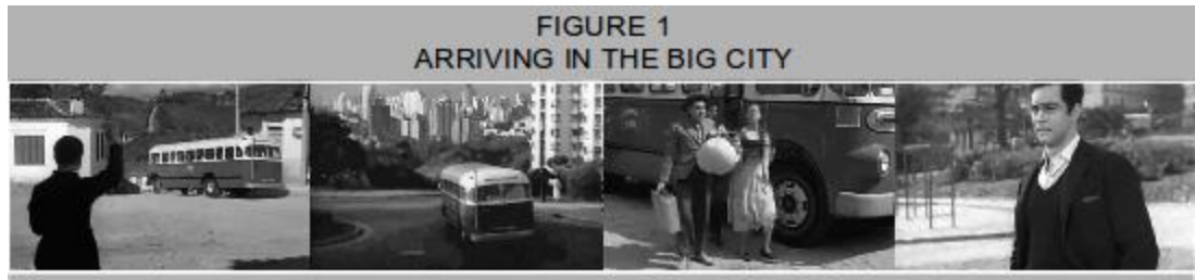
From right to left: (1) The departure from the countryside; (2) The arrival; (3) The parents; (4) The son's reaction when seeing his parents in a new context.

The opening of Chofer de Praça clarifies what we are saying here. The sequence contrasts strongly the rural (including small towns) with the urban environment, represented by São Paulo in the 1950s. It shows an old couple catching a bus in a little town. They are going to meet their son, an undergraduate medicine student living in São Paulo. In Figure 1, we can see some takes in which the affective ties from small towns (take 1) are contrasted with the "desert" occupied only by skyscrapers (take 2). The incompatibility of the couple with the townscape is reinforced by the cut that shows the reaction of the son when he sees his parents (takes 3 and 4), so that the cultural diversity had been highlighted.