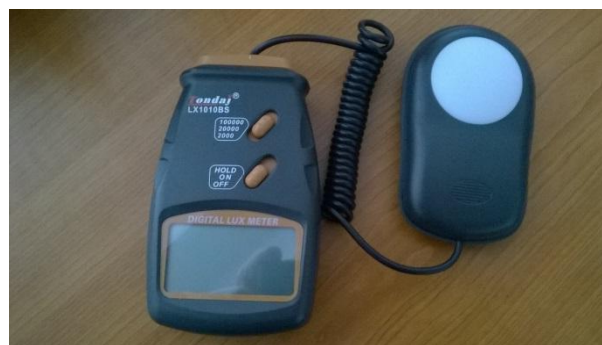
Figure4: Digital Luxmeter Tondaj

That in our line-up voltage alters the battery was permanently connected to batteries recharger. As a light source was used halogen headlamp designed filament lamp. Therefore, we have installed to the headlamp filament lamp H4. Measurements have been performed with the passing fiber lighting. This leaves simulated location of headlamp in normal vehicle. Check whether during the measurement there isn't change of voltage and current, we carried out by voltmeter in detecting light intensity. We examined the illumination distance of 1,2 m in front of headlamp, where we put luxmeter Tondaj LX1010BS FIG, figure 4.