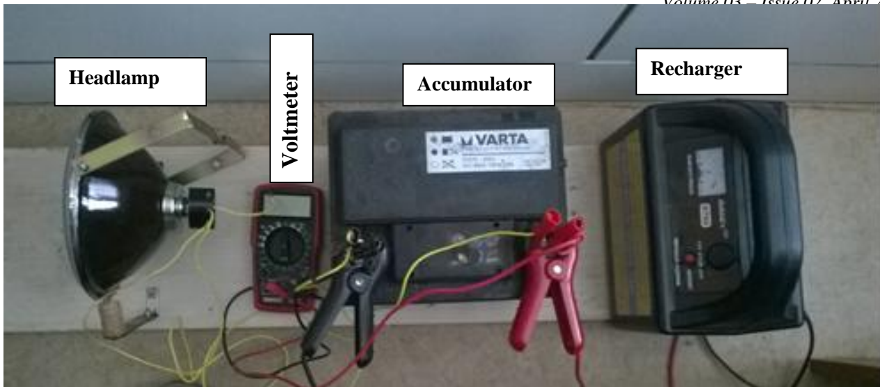
Figure 3: Assembly for the measurement

One of the reasons for variations of intensity the light is the supply voltage variation. We simulated the location of headlamp in real car. Therefore, the headlamp was supplied by the current from battery. Just to be sure, that to measure will not be used battery with low capacity battery status was checked by measuring device of the battery pack. His condition was set at 75%. The battery will after a certain time loss voltage at the terminals. In the real vehicle is a source of electrical energy accumulator, which is connected to a power supply, which is the alternator. Such an assembly guarantees that that battery is recharged in service and charged and not decreasing the voltage at the terminals or the ability to supply the required current intensity.