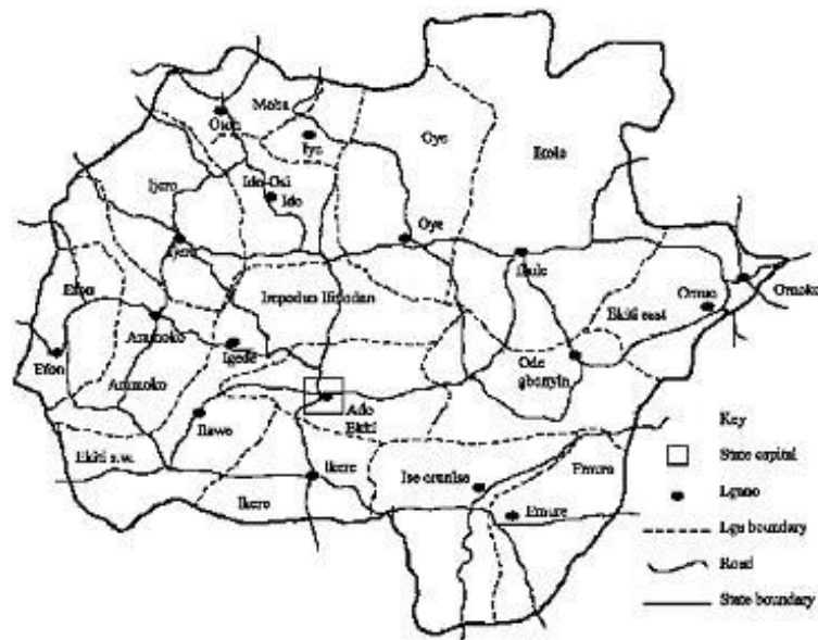
Fig 1: Map of Ekiti State, Nigeria showing the geographical location of the study area.

The study area is Ado-Ekiti which serves the dual roles as the headquarters of Ado Local Government and the capital of Ekiti State, Nigeria. It is situated 254 kilometers East of Ibadan, capital city of Oyo State, Nigeria, 218 kilometers, South of Ilorin, capital of Kwara State, 351 kilometers, North East of Lagos, the commercial capital of Nigeria. Ado-Ekiti lies between Latitude 7^{\circ} 40' North of the equator and Longitude 5^{\circ} 15' East of Greenwich meridian (about 400 m a.s.l ) in South Western Nigeria.