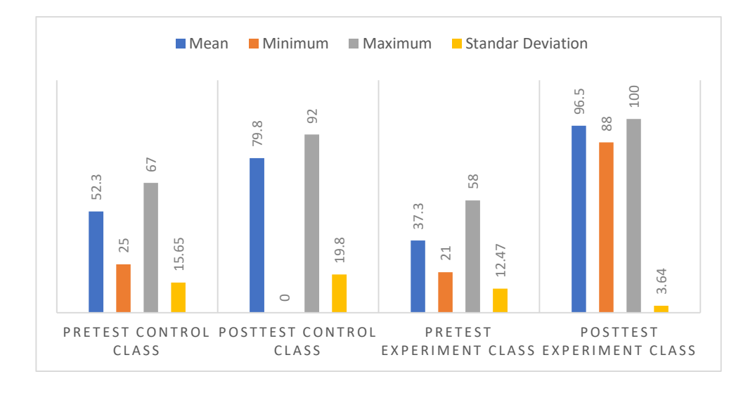
Figure 1. Comparison Diagram of Control Class and Experiment Class

Based on the table above, it can be seen that the highest score in the control class rose from 80 at the pretest to 91.7 after the posttest, while the minimum score from 54 at the pretest became 66.7 at the posttest. For the experimental class, the minimum score increase at the pretest was from 38 to 87.5 at the posttest. As for the highest score obtained by students in the experimental class, it rose to 100 which previously the maximum value was only around a score of 38. For the increase in the average percentage in the control class, it increased from pretest to posttest by 57.6%, while in the experimental class it increased by 94.2%. If the average increase is compared between the pretest and posttest scores, the increase in the experimental class is higher than the control class with a difference of 36.6%.