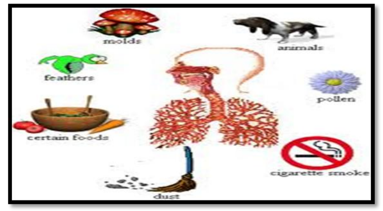
Figure 2: Some Triggers of Asthma Attack [14].

The lung is susceptible to oxidative injury by virtue of myriads of reactive forms of oxygen species and free radicals. The generation of reactive oxygen species in the lungs is enhanced after exposure to numerous exogenous chemical and physical agents, which include mineral dusts, ozone, nitrogen oxides, ultraviolet and ionizing radiation and tobacco smoke. Oxidant stress can lead to peroxidation of membrane lipids, depletion of nicotinamide nucleotides, rises in intracellular calcium ions, cytoskeleton disruption and DNA damage [4] .