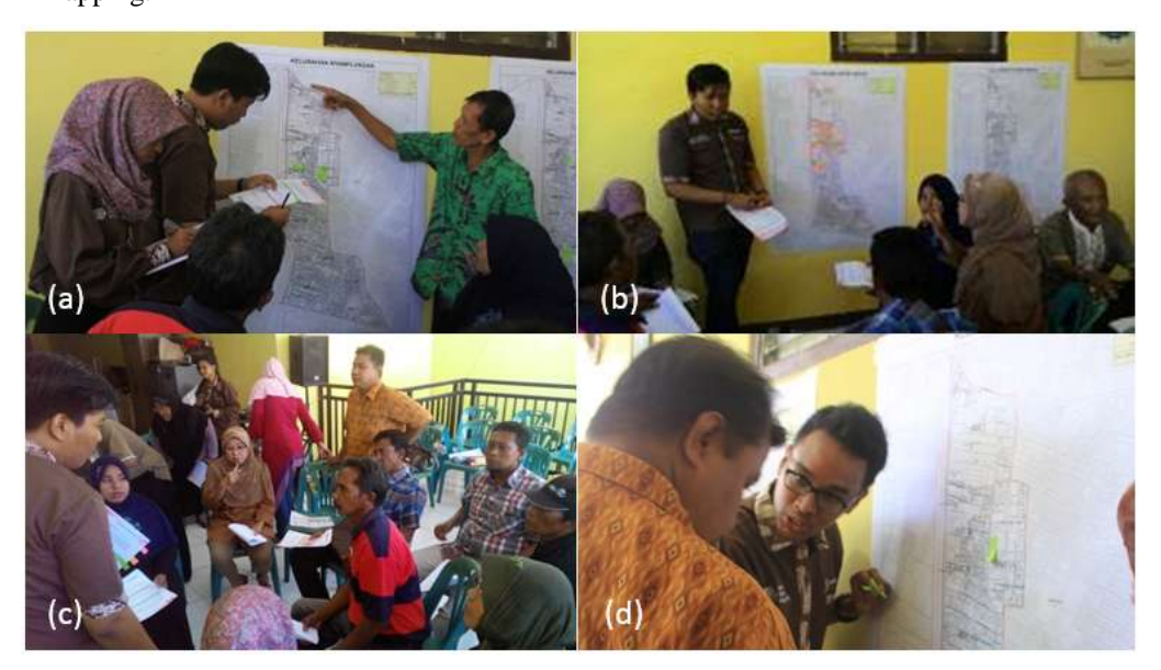
Figure 1: Participatory Mapping Assistance: (a) Mapping Directly; (b) Discussing the Problems; (c) Explaining the Potential Area; (d) re-Asking to Equate Perception

(GIS) software and resulted amount 38.25 Ha area classified as moderate fire risk and 14.64 Ha area classified as low risk of fire. These results have been presented to the community about zooning fire risk through participatory mapping.