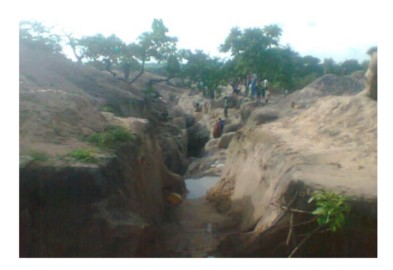
Plate 5.1 Vein 2 Baryte Mining Site

Based on the result on Table 5.1, Vein 2 has an area of 77226m^2 and Vein 17 has 132,096m^2 that have been devastated by baryte mining.