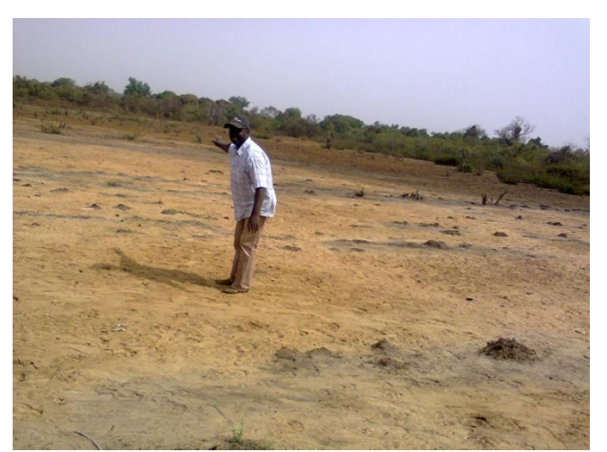
Plate 5.3 Land Destroyed by Acid Mine Drainage