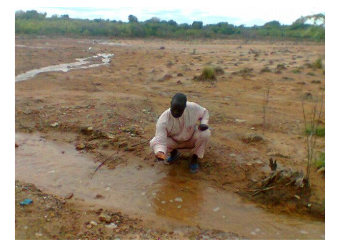
Plate 5.2 Acid Mine Drainage water at Vein 2 Baryte Mining Site The researcher is fetching water sample

From Table 5.3, more than 1000 acres of arable lands have been lost to Baryte mining in the study area. Vein 2 alone, lost about 755 acres of arable lands, while, 240 acres of cultivable land have been devastated, Vein 17