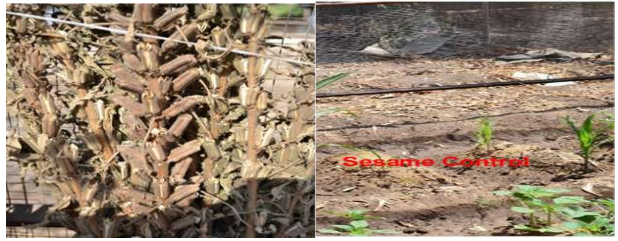
Dry down stage 25/10/2015