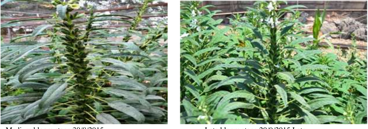
Medium bloom stage 30/8/2015