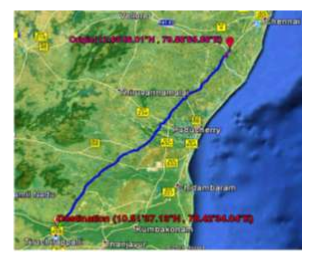
Figure 1: Alignment OD coordinates of Study area