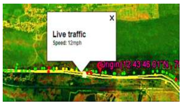
Figure 2: Live traffic data from google earth

The traffic data and the vehicular movement are studied using google earth live traffic mode besides the one way traffic data is collected at Paranur toll gate located at the origin of this project. The variations in the vehicle their relative motion and density are clearly depicted in Figure 2, where the colours indicate the speed of traffic on the road. Green means there are no traffic delays. Orange means there's a medium amount of traffic. Red means there are traffic delays. The more red, the slower the speed of traffic on the road. Also the continuous dot indicate the continuous movement of vehicles.